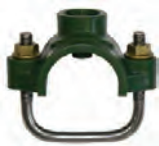
KLTPS40 with UBSS32/40