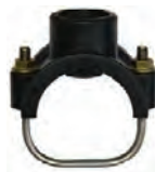
KLTPS63 with UBSS63