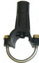
KLTS32 or KLTS40 with UB32/40