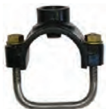
KLTPS32 or KLTPS45 with UBSS32/40