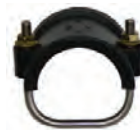
PTSB63 with UBSS63

*Please note: KLTS and KLTPS ranges do not come with brass flange nuts and need to be ordered separately.