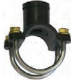
RXTS4015 with UB32/40