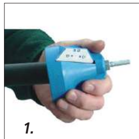
1. Cut the pipe square, then chamfer.