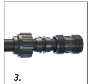
3. Push pipe into fitting, past the collar and o-ring, until pipe sits on ridge.