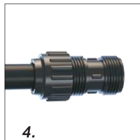
4. Slide nut and locking ring up to body and wind up.