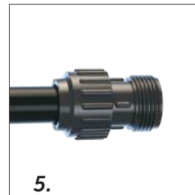
5. Tighten nut with wrench or equivalent.